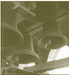
Iowa State University Library Special Collections Department