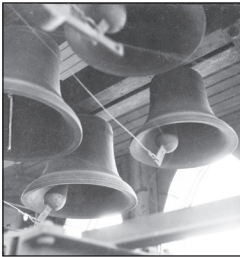
Iowa State University Library Special Collections Department